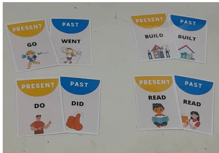
Figure 3: Sample matching pairs of some verbs during the Ive-Snap card game

The Ive-Snap card game can be employed as a teaching tool in the TBLT approach to teach irregular past tense verbs to Year 4 students. According to Chambers and Yunus (2017), using a variety of instructional techniques and classroom activities is essential for helping students with a range of needs since they can motivate students to actively participate in grammar classes.